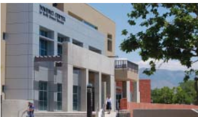
Domenici Center West Breezenay

Please email HSLICReservations@salud.unm.edu to schedule a common room.