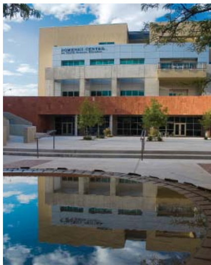
Domenici Center from Caynon Garden.

The Northeast building houses the Leonard M. Napolitano Ph.D. Anatomical Education Center (human anatomy lab), a 50 seat classroom, and the Interprofessional Healthcare Simulation Center. It contains a mock community pharmacy, sterile/non-sterile compounding areas, simulated inpatient rooms, a drop in skills lab, examination rooms for assessment, simulation and procedure rooms and debriefing rooms.