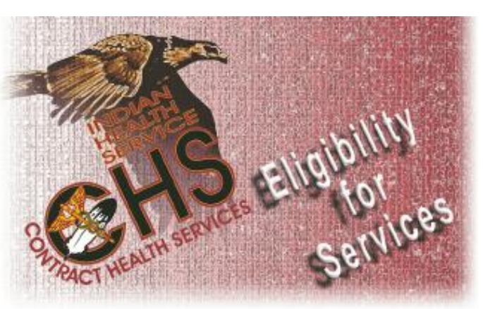
Eligibility for Contract Care

Specific policies and regulations created by Congress help determine who is eligible for Contract Health Services (CHS). In addition to showing proof of Indian descent or enrollment through Tribal or BIA documentation, you must: