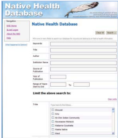
Native Health Database Screenshot: https://hscssl.unm.edu/nhd/

The NHD provides information for the benefit, use, and education of organizations and individuals with an interest in American Indian and Alaskan Native health-related issues, programs, and initiatives. Most of these articles have been abstracted to allow the user an overview of a document's contents.