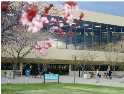
Health Sciences Library and Informatics Center