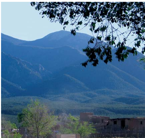
Taos Mountain

Native American Health Information Services focus on health information delivery, health information training, and collection development consultation.