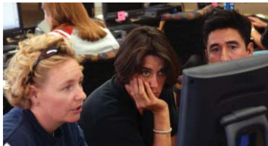
HSLIC offers a wide variety of resources and training on how to use them