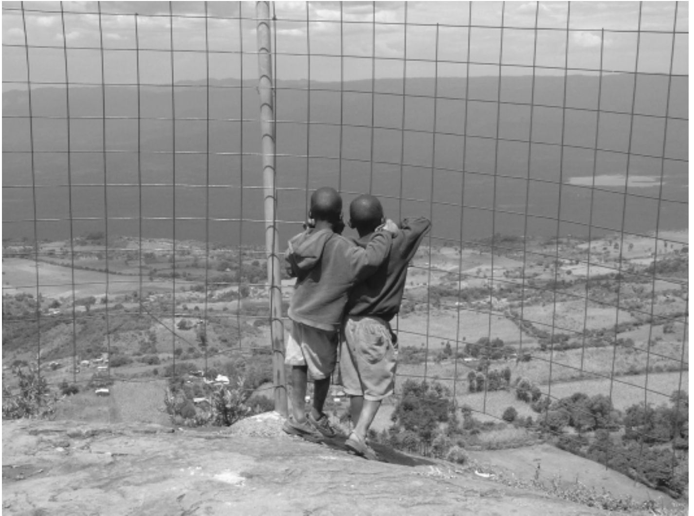
Overlook – Great Rift Valley, Kenya