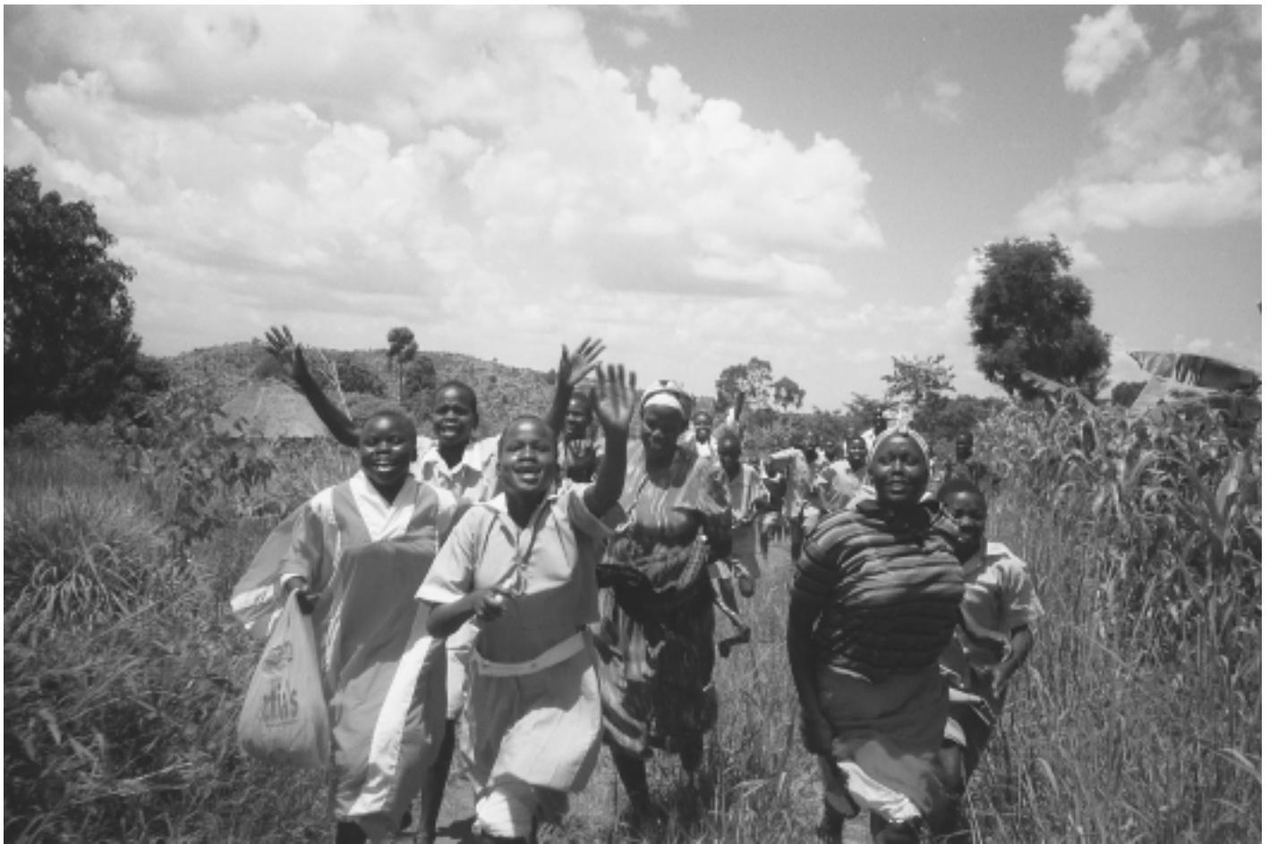
Kenyan women waving goodbye