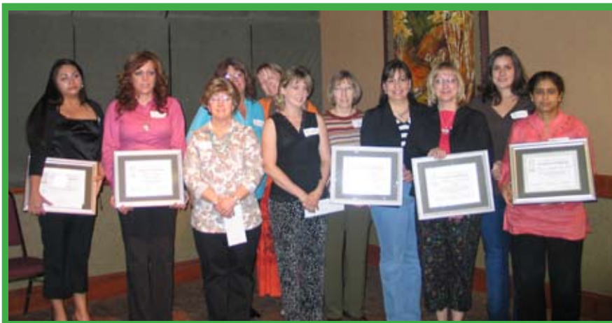
Award winners from Region III

Secretary of Health, Michelle Lujan Grisham presented the awards and congratulated each of the practices for helping protect the state's children.