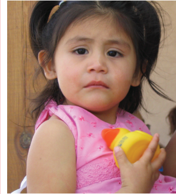
Girl who just received her immunizations at the Dia del Niño immunization event at National Hispanic Cultural Center, holding NMIC Rubber Duck.