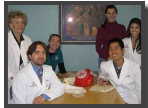
School Influenza Immunization Project (SIIP) clinic volunteers with APS school nurse at Grant Middle School

4/24-30 National Infant Immunization Week