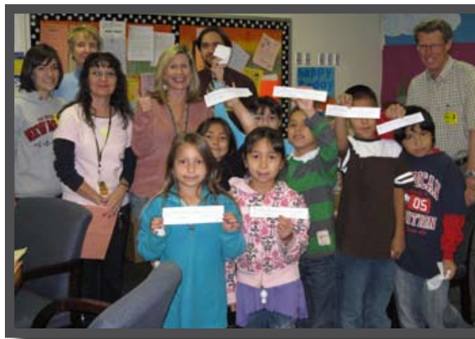
Children immunized at a SIIP clinic with their school nurse and UNM volunteers

This year SIIP provided only FluMist® vaccine at the schools. This was praised for simplifying the program but was also seen as a barrier to vaccinating all children against influenza since FluMist® cannot be given to children with certain high-risk conditions.