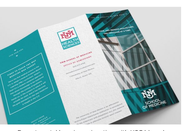
Departmental logo in conjunction with HSC blogo logo: Use the departmental logo on the front of the document and the HSC block logo on the back (never side by side.)

When departments and units partner, the umbrella logo should be used, and the names of the units should be written out. This is often the HSC block logo, but can also be entities such as UNM Health or School of Medicine. Do not use multiple logos on a single document.