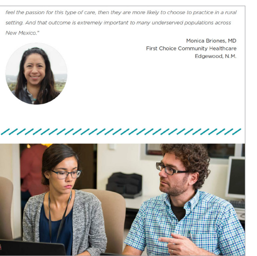
Academic unit: border details break up a page.

Several graphic elements are completely unique to the HSC Brand. These functional and ornamental elements, slightly inspired by Southwestern artwork, were created to help frame and highlight content. These graphic elements add a visually interesting detail to call out information within a design but should not overpower a composition. The borders can either run horizontally along the top of bottom of layouts, photos, or blocks of copy; or they can act as corner pieces, making a 90° angle. The HSC Brand also incorporates the copy divider found in the UNM Brand.