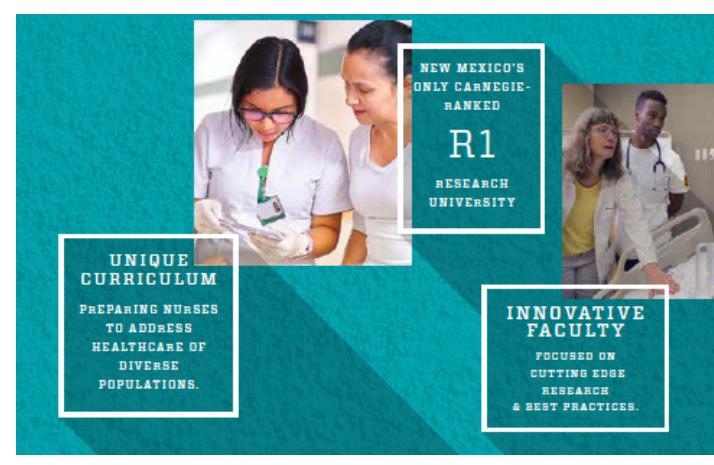
Academic units: shadows off of containers draw attention to headlines.