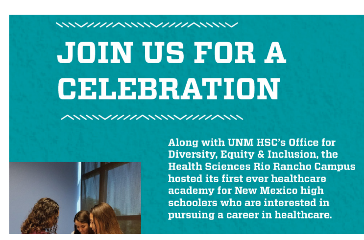
Academic unit: border details call out a headline in an invitation.