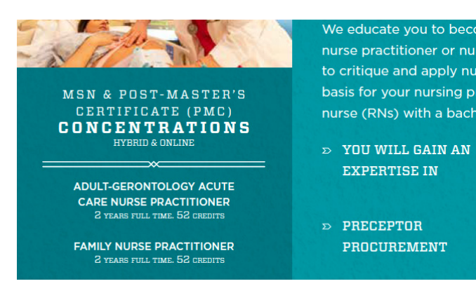
Academic unit: border details separate sections on a flyer.