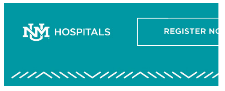
Clinical unit: border details highlight an e-blast.