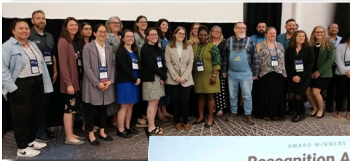
An array of photos from the AIRA Conference