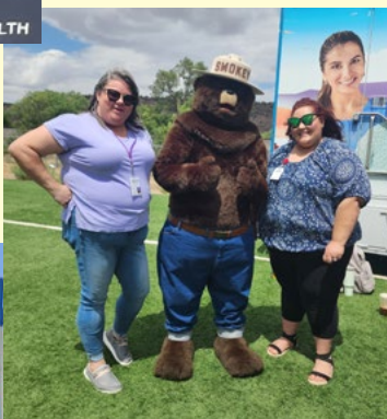
The Pueblo of San Felipe awarded the Immunization Program and Mobile Vaccine Team certificates of appreciation for participation