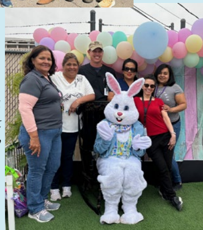
La Casa Block Party