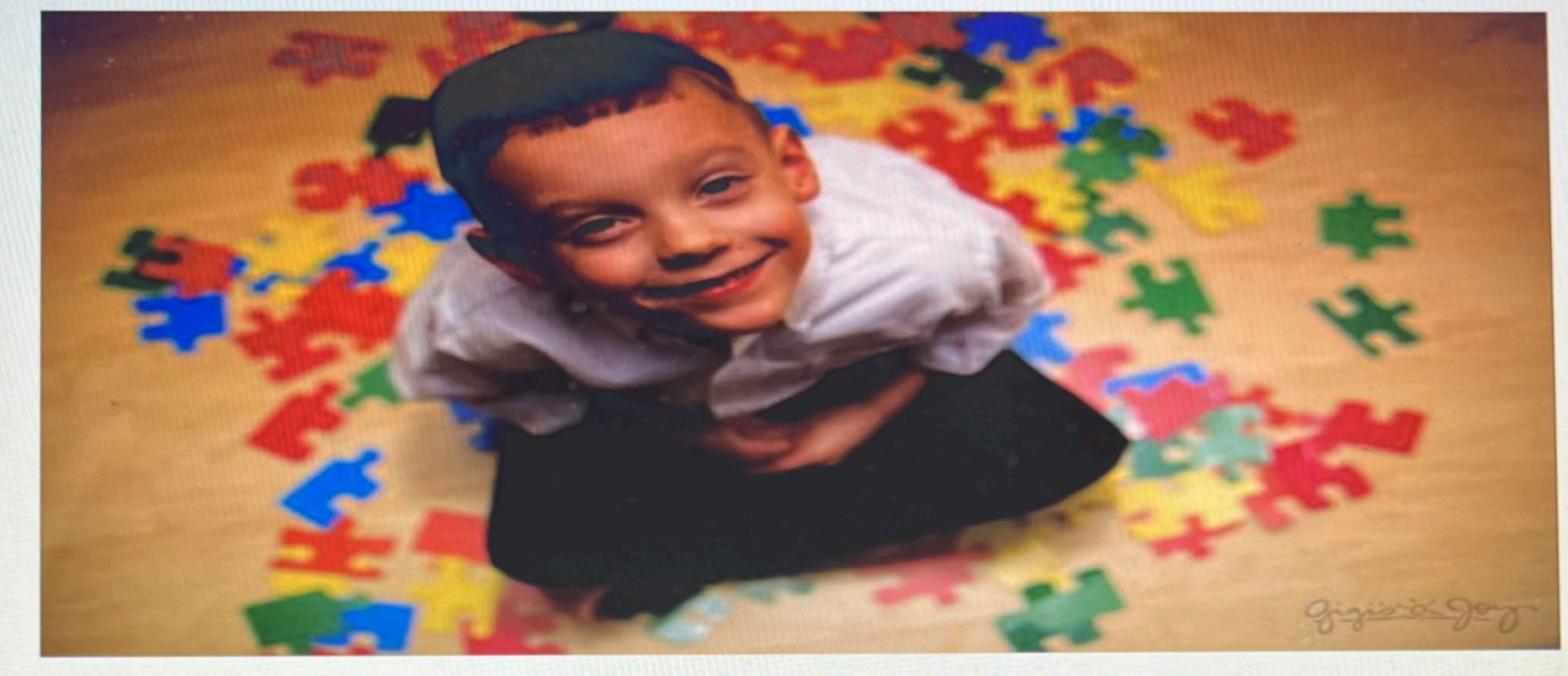
Guidance Center of Lea County – Autism Clinic