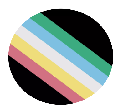
WHEN WE DESIGN FOR ACCESSIBILITY. WE ALL BENEFIT