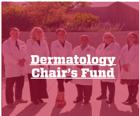
Dermatology Chair's Fund