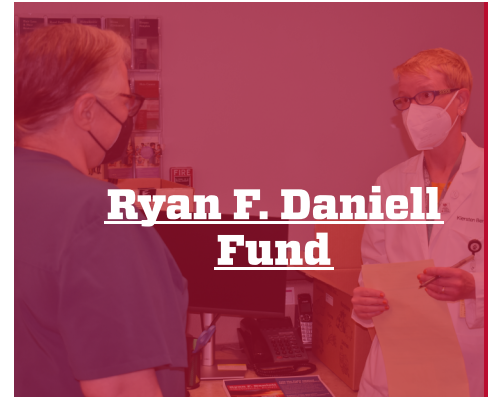
Ryan F. Daniell Fund

Created by a generous, private donor in 2016, the Dermatology Chair's Fund provides flexibility to invest wherever the needs are greatest - to date these dollars have supported Grand Rounds and alumni/networking initiatives, along with strategic planning and Department-wide initiatives.