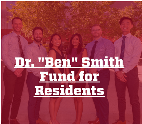
Dr. "Ben" Smith Fund for Residents

The Dr. "Ben" Smith Fund for Residents supports the annual budget of the Dermatology Residency Program, especially to cultivate academic research and scholarly presentations at a national level, in addition to basic operational needs in keeping our training program stable and growing. We count on these dollars to help - please consider a gift this year!