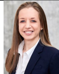
Università Vita-Salute San Raffaele Facoltà di Medicina