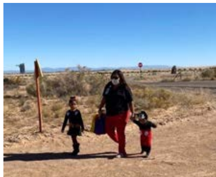
To'Hajiilee Community Feast and Fun Walk participants.