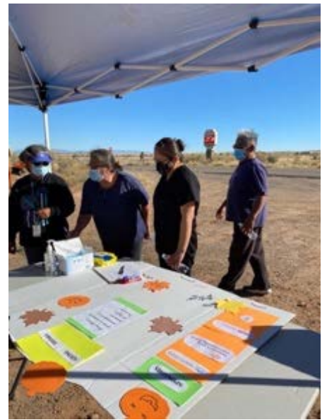
2021 Fun Walk Registration