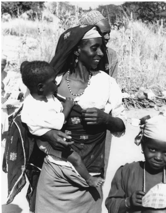
Fulani Mother & Child

With the funds that remained after the new settle-