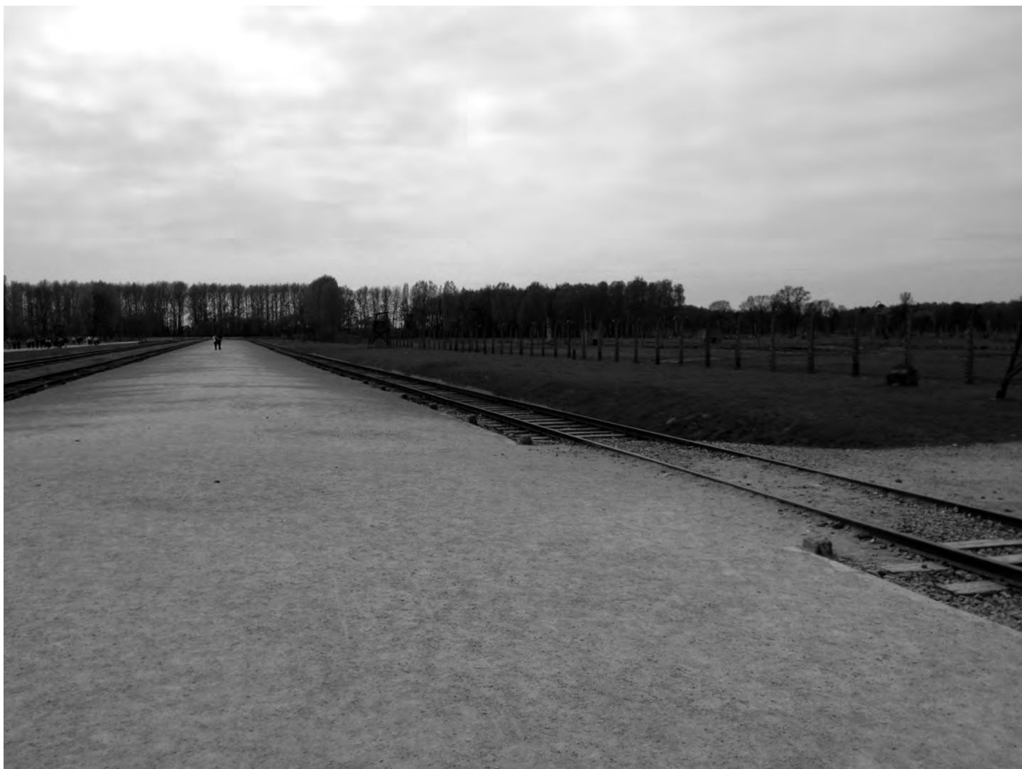
Dirt road with destroyed gas chambers in distance, figure 1-A.