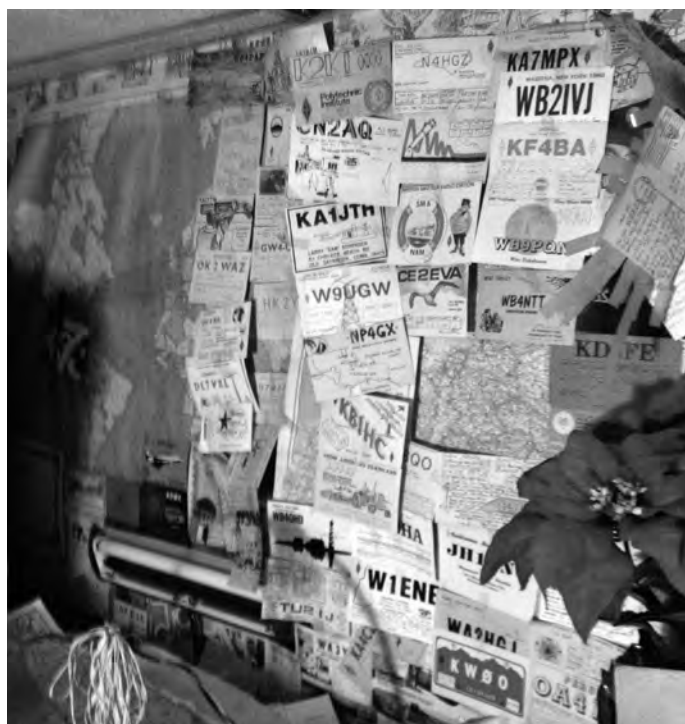
Bert's map room, figure 5.

We toured the house, basement, and visited the map and board where Bert had communicated around