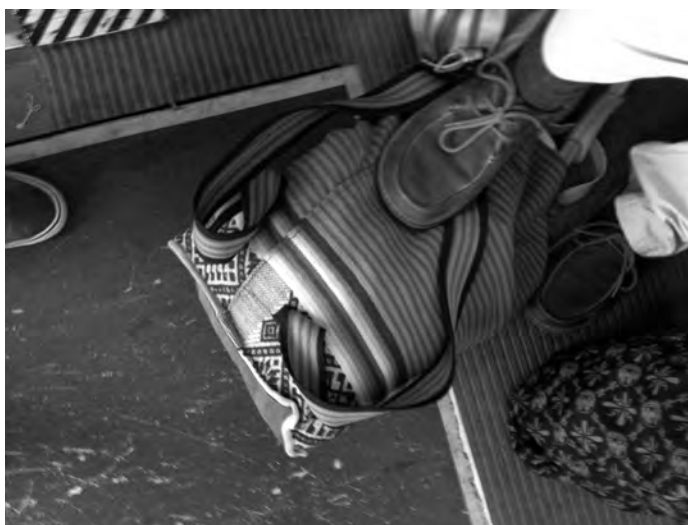
Shoes on the road to Denver, figure 3.