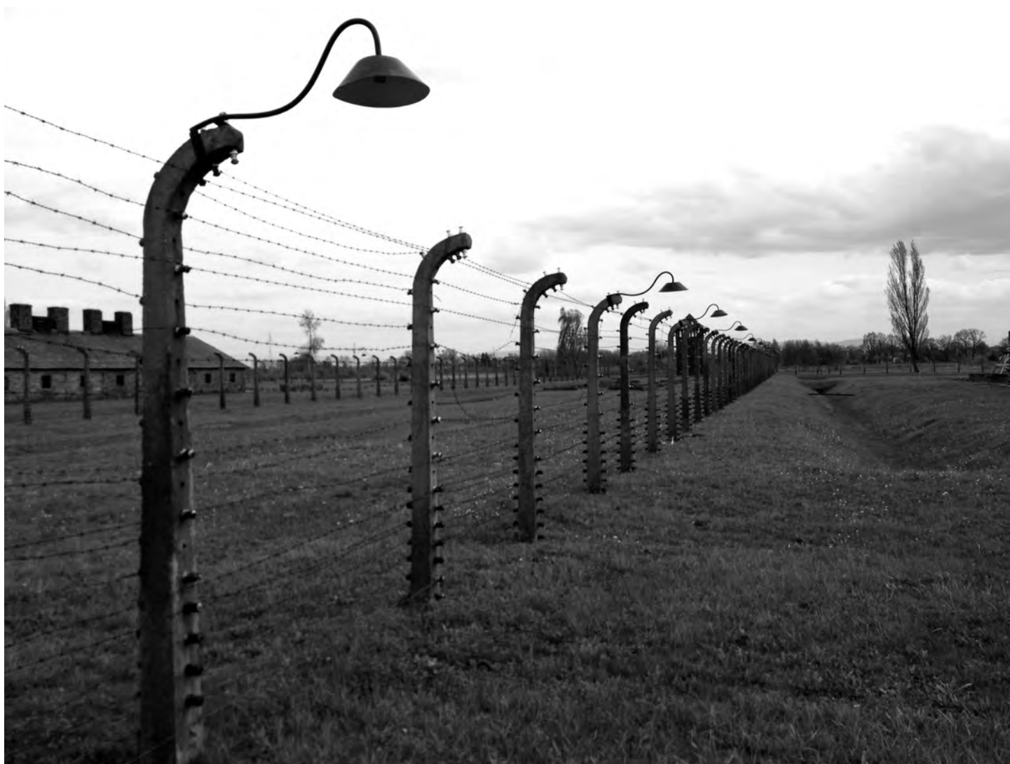
Berkenau fences, figure 1-B.

six years older than my father, was balding, wore tortoise shell glasses, and always chewed on a cigar that was never lit.