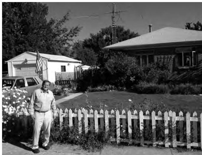
Bert and Goldie's house with radio antennae, figure 4.