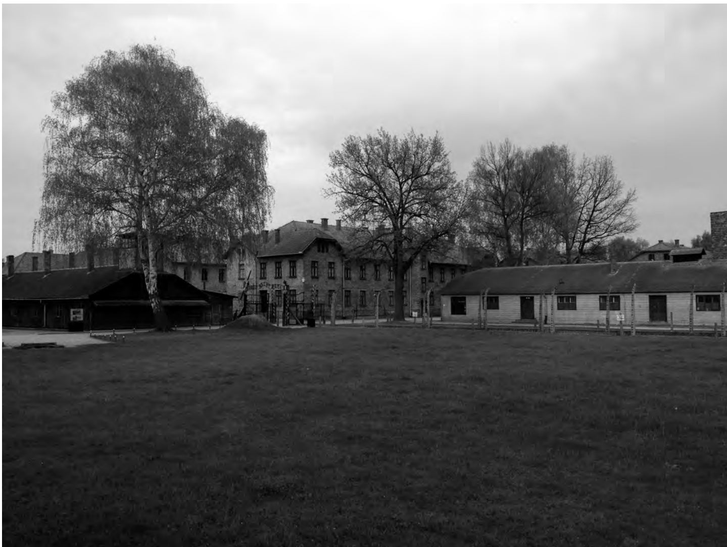
Labor camp at a distance, figure 1-C.

told. Our guide's description of the Nazi terror was incongruous of the season, as we viewed acres of green grass and trees in full bloom. I did not see any birds. It was then I noticed that my shoes were becoming covered in dust.