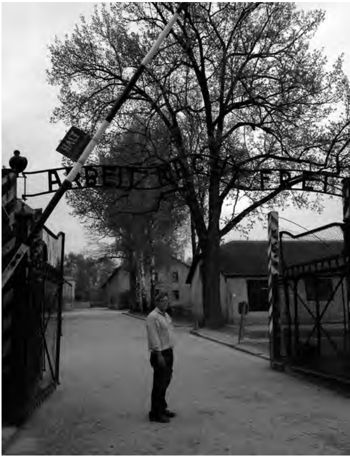
Under the gate at the labor camp, figure 1-D.