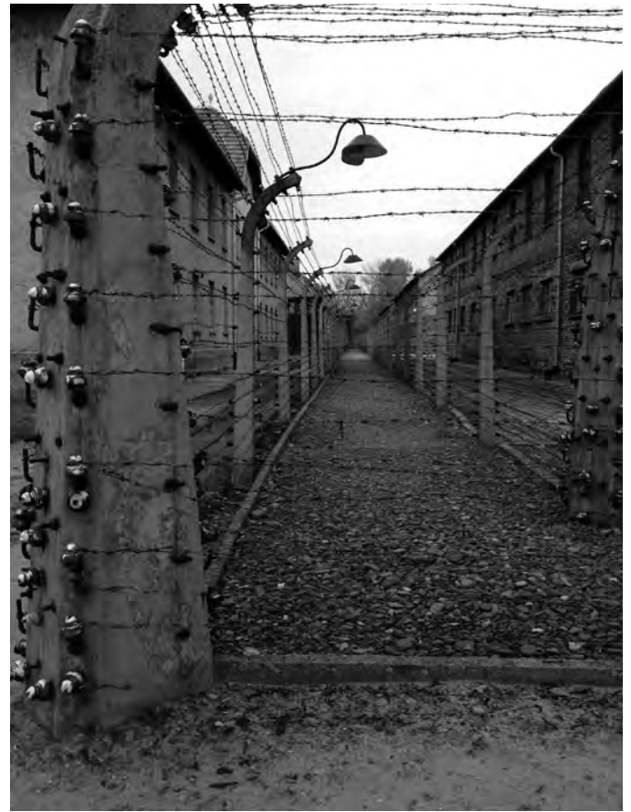
Fences inside the labor camp, figure 1-E.