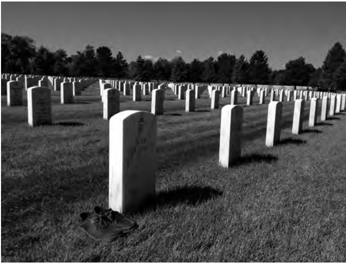
Shoes at Fort Logan, figure 6-A.