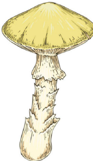
Death Cap (poisonous)