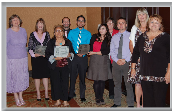
NMIC 2013 Immunization Champions with the folks who nominated them

Jamie's story is beautifully captured in the video, "Facing Meningitis" from the Texas Children's Hospital: http://www.youtube.com/watch?v=h2-U1S74OH0