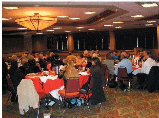
Marriott Pyramid North provided a beautiful meeting room for NMIC's celebration