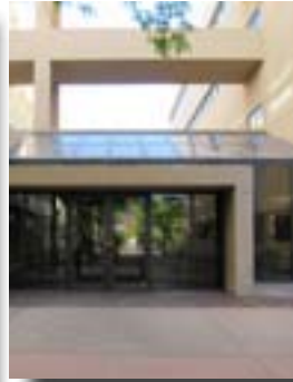
2. Go through the double doors and take a left towards the Basic Medical Sciences Building