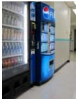
4. Take a right and walk past the vending machines. Take a LEFT towards the hallway past the elevator