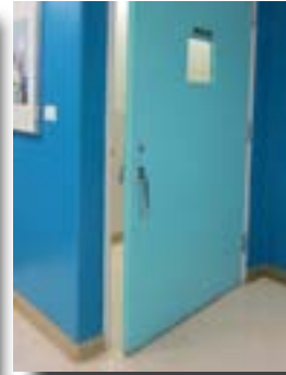
3. Go through the Teal Door on the RIGHT and walk down the stairs (There is a map on the wall)