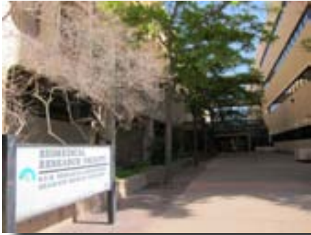
1. Go to the Biomedical Research Facility (North Entrance, ground floor)

Directions to: Human Research Protections Office BMSB B71 MSC: 08-4560 University of New Mexico Albuquerque, NM 87131 505.272.1129